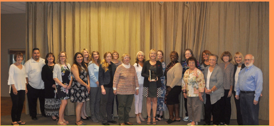
On October 24, CASA was honored by the Merced Sun-Star at the 4th Annual Excellence in Business Awards Luncheon Ceremony. CASA of Merced County, among six other local businesses and organizations were recognized at the ceremony which took place at Hilmar Cheese Company. The winners for each category, were selected by diverse panel of judges. CASA received the 2018 Excellence in Business Award in the Charitable/Non-Profit category. Staff, Board Members and CASA Volunteers were present on behalf of the organization.