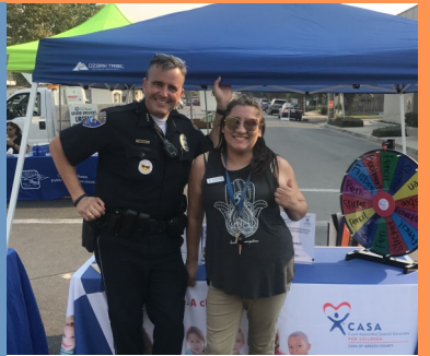
On August 7, CASA participated in National Night Out in Merced, Los Banos and Atwater!