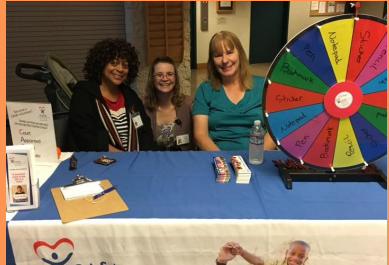
October 4, Valley Crisis Center's Peace for Families March.