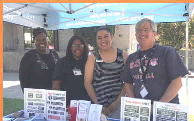
October 17, Fall Career Fair Merced College