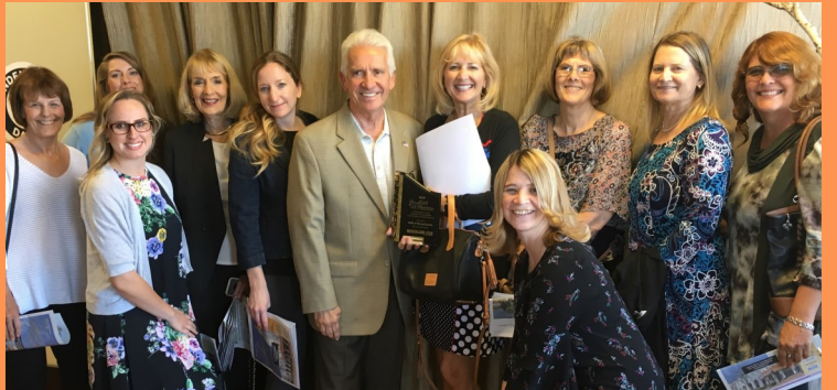
On October 24, Congressman Jim Costa was present to congratulate recipients of the 2018 Merced Sun-Star Excellence in Business Awards. Congressman Jim Costa has been a consistent supporter of CASA of Merced County for many years.