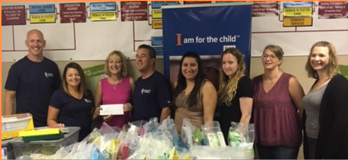
On August 17, in lieu of a company picnic, Berliner Cohen held a "Day of Service." Their staff prepared 36 EPEC kits (Essential Packs for Every Child) and delivered them to CASA of Merced County, along with extra supplies and a generous donation. EPEC kits are age and gender appropriate packs, which contain basic hygiene and school supplies. These kits are given to children when they are detained and placed in foster care. Thank you to the Merced and Modesto offices of Berliner Cohen, LLP.