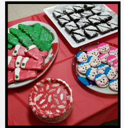
Some of the delicious desserts