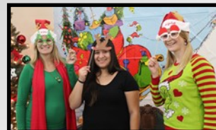
Some of the CASA staff feeling festive

On December 19, 2019 CASA of Merced County hosted our annual Christmas Party for CASA youth. This year's theme was The Grinch that Stole Christmas (or in this case did NOT steal Christmas). The kids and their Advocates were treated to dinner and dessert. The kids played games and had a visit from Santa. CASA would like to give a huge thank you to MID - who fundraises all year long to provide our CASA children with fantastic gifts! Each child went home with gifts and huge smiles. Without the support of MID, many of these children would not have a Christmas.