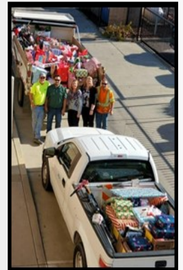
Santa's Helpers AKA MID loading up for delivery to the Christmas party