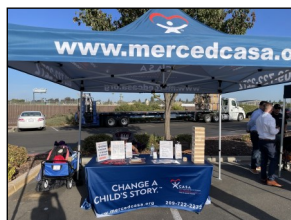
Atwater National Night Out