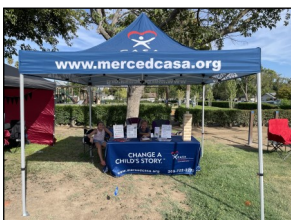
Merced National Night Out

Events like National Night Out are a true treasure for so many Merced County families. Learning about the resources available as well as ways to give back to our community is an invaluable occasion for city! We are so excited that these great family events have started again and that we can be apart of it!