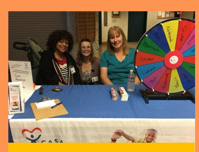
October 4, Valley Crisis Center's Peace for Families March.